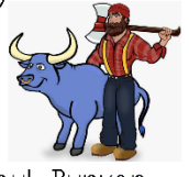
Paul Bunyan & Babe the Blue Ox